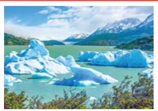
Meals: B, L, D

Visit a local estancia for a glimpse of daily life on a traditional ranch and enjoy a typical Patagonian asado lunch