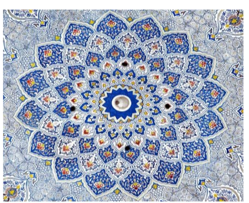
Photo fees may be payable at most attractions you will visit in Samarkand, approximately USD$14 in total.

Due to safety reasons, buses are not allowed on the mountain pass from Samarkand to Shakhrisabz, therefore you will travel in smaller vehicles for this leg of the journey before travelling by coach again from Shakhrisabz onwards.