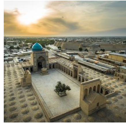
Photo fees may be payable at most attractions you will visit in Bukhara, approximately USD7 in total.

Women should bring a scarf from home, as you are required to cover your head at some attractions today.